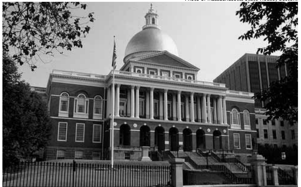
Photo of Massachusetts State House, Boston.