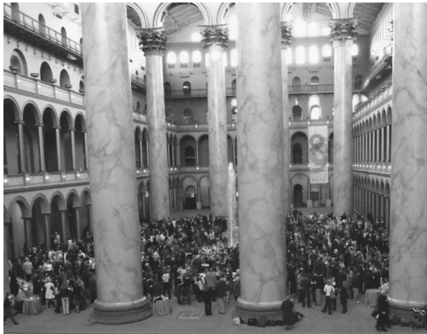
The 2009 Opening Reception at the National Building Museum.