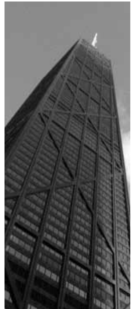
The Observatory at the John Hancock Tower offers panoramic views of Chicago.

■ Two Open Submissions Sessions , with speakers to be announced following the Fall 2009 competition.