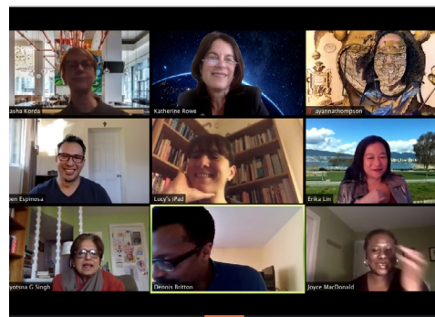
SAA Trustees holding meetings in March over Zoom.